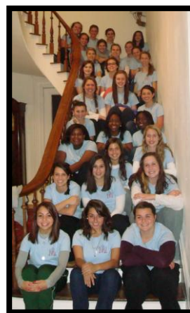
Left: 35 young women were enrolled into the Angelic Warfare Confraternity on November 6 th at the Dominican Motherhouse in Nashville, TN.