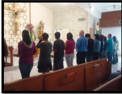
Photos at bottom and left are from Nashville Motherhouse in November.