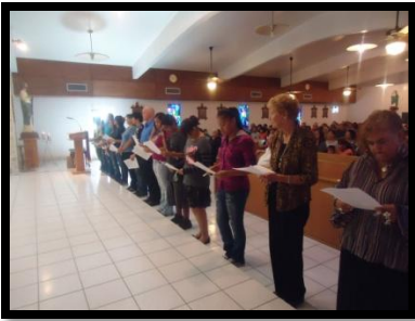
Photos at top and right are from the LaPryor enrollment on October 31 st .